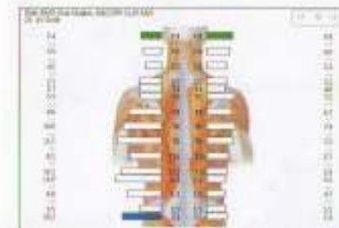
Initial SEMG Scan